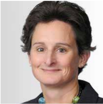
Flick Drummond MP Co-Chair

This inquiry and report came out of startling statistics that women who have been out of the workplace for more than six months find it very difficult to get back into employment.